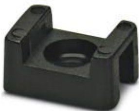
Cable binder base, for cable binders up to 5 mm wide, screwable, 3.5 mm fixing hole, 2-sided cable binder feed-through

Please be informed that the data shown in this PDF Document is generated from our Online Catalog. Please find the complete data in the user's documentation. Our General Terms of Use for Downloads are valid ( http://phoenixcontact.com/download )