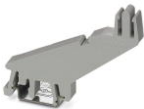
Cover profile holder, 10 mm wide, for mounting on NS 32 or NS 35/7.5, for fixing the holding profile APK-HP, labeling with Zack strip ZB 10

Please be informed that the data shown in this PDF Document is generated from our Online Catalog. Please find the complete data in the user's documentation. Our General Terms of Use for Downloads are valid ( http://phoenixcontact.com/download )