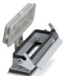
HEAVYCON panel mounting base B24, with single locking latch made of sheet steel, height 27 mm, with plastic cover, with flat gasket

Please be informed that the data shown in this PDF Document is generated from our Online Catalog. Please find the complete data in the user's documentation. Our General Terms of Use for Downloads are valid ( http://phoenixcontact.com/download )