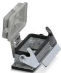
HEAVYCON panel mounting base B10, with single locking latch made of sheet steel, height 27 mm, with plastic cover, with flat gasket

Please be informed that the data shown in this PDF Document is generated from our Online Catalog. Please find the complete data in the user's documentation. Our General Terms of Use for Downloads are valid ( http://phoenixcontact.com/download )