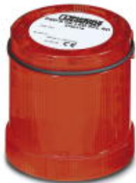
LED random flashing beacon element, 24 V DC, red

Please be informed that the data shown in this PDF Document is generated from our Online Catalog. Please find the complete data in the user's documentation. Our General Terms of Use for Downloads are valid ( http://phoenixcontact.com/download )