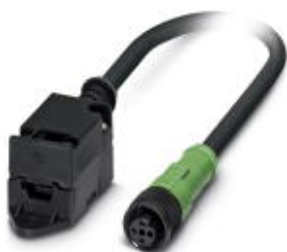
Bus system cable, AS-Interface, 2-position, PUR/PVC, black RAL 9005, shielded, Plug straight AS-i, on Socket straight M12, coding: A, cable length: 3 m, with plastic knurl

Please be informed that the data shown in this PDF Document is generated from our Online Catalog. Please find the complete data in the user's documentation. Our General Terms of Use for Downloads are valid ( http://phoenixcontact.com/download )