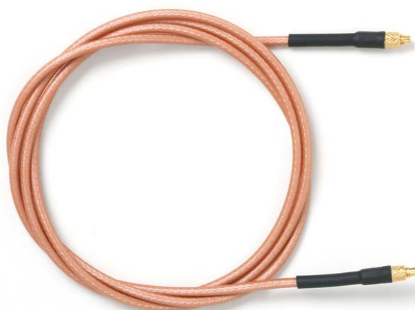
Model 73063 MMCX Plug to MMCX Plug, RG316/U

Snap-on coupling and micro-miniature size for fast connect and disconnect where space is limited