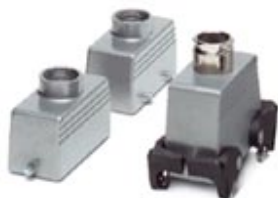
Sleeve housing, with double locking latch, height: 65 mm, with supports, 1 x Pg21, lateral cable outlet

Please be informed that the data shown in this PDF Document is generated from our Online Catalog. Please find the complete data in the user's documentation. Our General Terms of Use for Downloads are valid ( http://phoenixcontact.com/download )