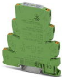
Timer relay with switch-off delay (with control contact) and an adjustable time range (0.1 s - 10 s), with push-in connection

Please be informed that the data shown in this PDF Document is generated from our Online Catalog. Please find the complete data in the user's documentation. Our General Terms of Use for Downloads are valid ( http://phoenixcontact.com/download )