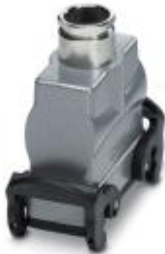
HEAVYCON B24 coupling housing, with double locking latch, height: 81.5 mm, with 1 x Pg29 screw connection, straight cable outlet

Please be informed that the data shown in this PDF Document is generated from our Online Catalog. Please find the complete data in the user's documentation. Our General Terms of Use for Downloads are valid ( http://phoenixcontact.com/download )