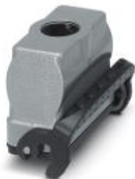
HEAVYCON B16 coupling housing, with single locking latch, height: 82 mm, with 1 x M25 gland, straight cable outlet

Please be informed that the data shown in this PDF Document is generated from our Online Catalog. Please find the complete data in the user's documentation. Our General Terms of Use for Downloads are valid ( http://phoenixcontact.com/download )