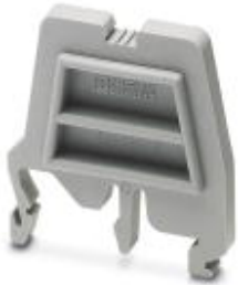
Flange cover, Length: 43.3 mm, Width: 5.2 mm, Color: gray

Please be informed that the data shown in this PDF Document is generated from our Online Catalog. Please find the complete data in the user's documentation. Our General Terms of Use for Downloads are valid ( http://phoenixcontact.com/download )