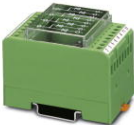
Lamp test module, 2 diodes with common cathode: with 4 pairs, for individual wiring

Please be informed that the data shown in this PDF Document is generated from our Online Catalog. Please find the complete data in the user's documentation. Our General Terms of Use for Downloads are valid ( http://phoenixcontact.com/download )