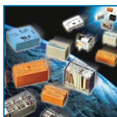
Schrack PCB Relays