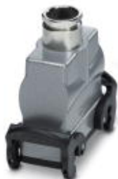
HEAVYCON B24 coupling housing, with double locking latch, height: 81.5 mm, with 1 x Pg21 screw connection, straight cable outlet

Please be informed that the data shown in this PDF Document is generated from our Online Catalog. Please find the complete data in the user's documentation. Our General Terms of Use for Downloads are valid ( http://phoenixcontact.com/download )