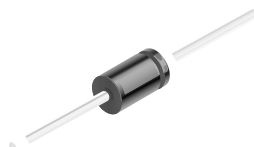
DO-35 Glass case COLOR BAND DENOTES CATHODE