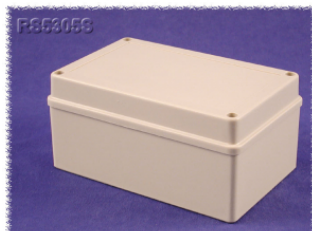
Assembled View (Top)