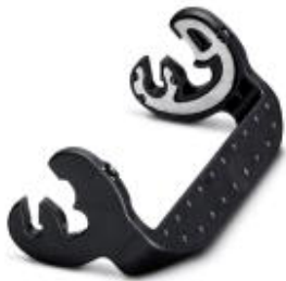
Replacement plastic single locking latch for standard housings of type B16

Please be informed that the data shown in this PDF Document is generated from our Online Catalog. Please find the complete data in the user's documentation. Our General Terms of Use for Downloads are valid ( http://phoenixcontact.com/download )