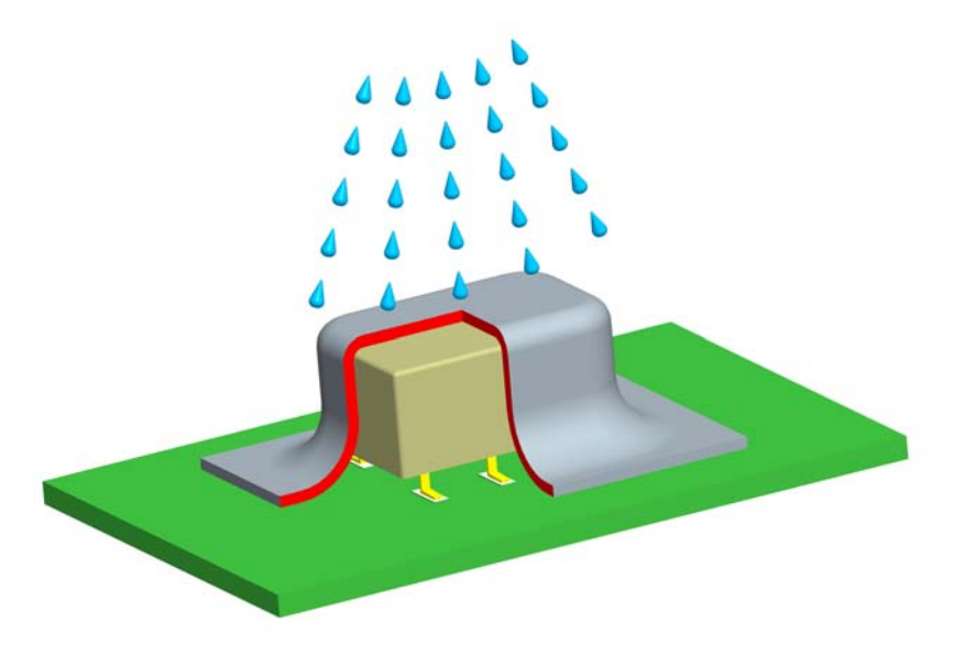
Fig. 4: Coating of relays on PCB's

Suitable are Epoxy, Urethane and Fluorine coatings. Absolutely forbidden are Silicone coatings.