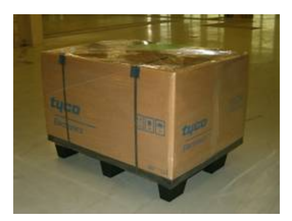
Fig. 1: Proper packing of relays for transportation

In transit, care has to be taken to avoid excessive shock and vibration. Mechanical stress can lead to changes in operating characteristics or to internal damage of the relay (see vibration and shock resistance). If mechanical stress is suspected, the relay should be checked and tested before use. Whenever relays arrive in damaged boxes at customer sides, there is a potential risk of transportation damage.