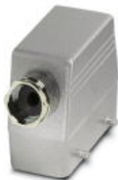
Sleeve housing, for double locking latch, height 76 mm, with screw connection, 1x Pg21, lateral cable entry

Please be informed that the data shown in this PDF Document is generated from our Online Catalog. Please find the complete data in the user's documentation. Our General Terms of Use for Downloads are valid ( http://phoenixcontact.com/download )