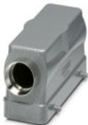
HEAVYCON B24 sleeve housing, for double locking latch, height: 65 mm, with 1 x M25 gland, lateral cable outlet

Please be informed that the data shown in this PDF Document is generated from our Online Catalog. Please find the complete data in the user's documentation. Our General Terms of Use for Downloads are valid ( http://phoenixcontact.com/download )