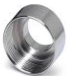
Step-up adapter, M25 to M32, including O-ring

Extension adapter - ENLAR-M-KV-M25/M32 - 1647679