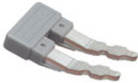
Insertion bridge, Number of positions: 2, Color: gray

Please be informed that the data shown in this PDF Document is generated from our Online Catalog. Please find the complete data in the user's documentation. Our General Terms of Use for Downloads are valid ( http://phoenixcontact.com/download )