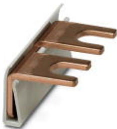
Wiring bridge for modules with connecting pitch 17.5 mm, 1-phase, 2-pos.

Please be informed that the data shown in this PDF Document is generated from our Online Catalog. Please find the complete data in the user's documentation. Our General Terms of Use for Downloads are valid ( http://phoenixcontact.com/download )