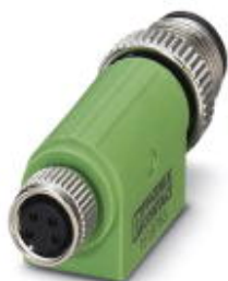
Adapter, 3-position, Plug straight M12, A-coded, on Socket straight M12, A-coded, Pin assignment: 1-1; 2-2; 3-3; 4 = N.C.

Please be informed that the data shown in this PDF Document is generated from our Online Catalog. Please find the complete data in the user's documentation. Our General Terms of Use for Downloads are valid ( http://phoenixcontact.com/download )