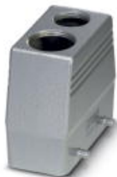
HEAVYCON B16 sleeve housing, for double locking latch, height: 76 mm, with 1 x M32/1 x M25 thread, straight cable outlet

Please be informed that the data shown in this PDF Document is generated from our Online Catalog. Please find the complete data in the user's documentation. Our General Terms of Use for Downloads are valid ( http://phoenixcontact.com/download )