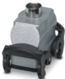
HEAVYCON B10 coupling housing, with double locking latch, height: 77.5 mm, with 1 x M205 gland, straight cable outlet

Please be informed that the data shown in this PDF Document is generated from our Online Catalog. Please find the complete data in the user's documentation. Our General Terms of Use for Downloads are valid ( http://phoenixcontact.com/download )