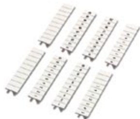
Zack marker strip, 10-section, horizontally labeled with the consecutive numbers: 21 ... 30, white, width: 5 mm

Please be informed that the data shown in this PDF Document is generated from our Online Catalog. Please find the complete data in the user's documentation. Our General Terms of Use for Downloads are valid ( http://phoenixcontact.com/download )