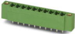
The figure shows a 10-position version of the product

Header, Nominal current: 8 A, Rated voltage (III/2): 160 V, Number of positions: 20, Pitch: 3.81 mm, Color: green, Contact surface: Tin, Mounting: Wave soldering