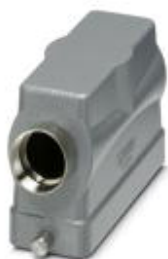
HEAVYCON sleeve housing B24, for single locking latch, height 76 mm, with support 1x M32, lateral conductor exit

Please be informed that the data shown in this PDF Document is generated from our Online Catalog. Please find the complete data in the user's documentation. Our General Terms of Use for Downloads are valid ( http://phoenixcontact.com/download )