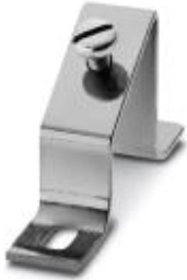
Angled brackets with M6 screw, for fixing DIN rails at an angle of 30°, height: 46 mm

Please be informed that the data shown in this PDF Document is generated from our Online Catalog. Please find the complete data in the user's documentation. Our General Terms of Use for Downloads are valid ( http://phoenixcontact.com/download )