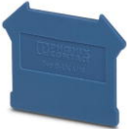
End cover, Length: 42.5 mm, Width: 1.8 mm, Height: 47 mm, Color: blue

Please be informed that the data shown in this PDF Document is generated from our Online Catalog. Please find the complete data in the user's documentation. Our General Terms of Use for Downloads are valid ( http://phoenixcontact.com/download )