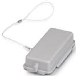
HEAVYCON protective cover, type B16, for supporting base element with single locking latch, with retaining cord, IP54, PA

Please be informed that the data shown in this PDF Document is generated from our Online Catalog. Please find the complete data in the user's documentation. Our General Terms of Use for Downloads are valid ( http://phoenixcontact.com/download )