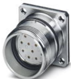
Device connector for front wall, straight, shielded: yes, Screw locking, M23, No. of pos.: 17, type of contact: Socket, Solder connection, Flat gasket, 4x Ø 3.2

Please be informed that the data shown in this PDF Document is generated from our Online Catalog. Please find the complete data in the user's documentation. Our General Terms of Use for Downloads are valid ( http://phoenixcontact.com/download )