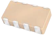
0508 - 4 Element