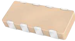
0612 - 4 Element

As the market leader in the development and manufacture of capacitor arrays AVX is pleased to offer a range of AEC-Q200 qualified arrays to compliment our product offering to the Automotive industry. Both the AVX 0612 and 0508 4-element capacitor array styles are qualified to the AEC-Q200 automotive specifications.