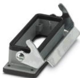
HEAVYCON panel mounting base B16, with single locking latch made of sheet steel, height 27 mm, with flat gasket

Please be informed that the data shown in this PDF Document is generated from our Online Catalog. Please find the complete data in the user's documentation. Our General Terms of Use for Downloads are valid ( http://phoenixcontact.com/download )