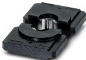
Crimping stamp for electro-hydraulic crimping device SL-Z0007 for turned crimp contacts, Ø 10 mm, SL series, crimping range 25 mm 2

Please be informed that the data shown in this PDF Document is generated from our Online Catalog. Please find the complete data in the user's documentation. Our General Terms of Use for Downloads are valid ( http://phoenixcontact.com/download )