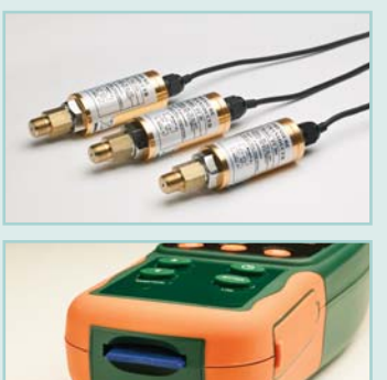
Transducers sold separately. Order PT300 (30psi), PT150 (150psi), or PT300 (300psi). Easy to access SD card for data storage and transfer