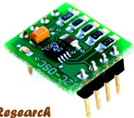
uResearch © 2007 Copyright, All Rights Reserved