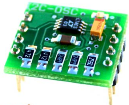
uResearch © 2007 Copyright, All Rights Reserved