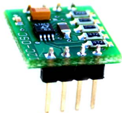
uResearch © 2007 Copyright, All Rights Reserved