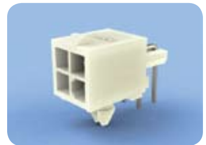
Right Angle Pin Header