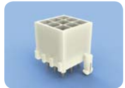
Vertical Pin Header