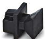
Dust protection caps for RJ45 socket

Dust protection - FL RJ45 PROTECT CAP - 2832991