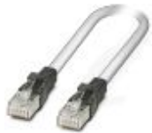
Patch cable, CAT5, assembled, 2 m

Patch cable - FL CAT5 PATCH 2,0 - 2832289