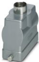
HEAVYCON B16 sleeve housing, for single locking latch, height: 76 mm, with 1 x M25 gland, straight cable outlet

Please be informed that the data shown in this PDF Document is generated from our Online Catalog. Please find the complete data in the user's documentation. Our General Terms of Use for Downloads are valid ( http://phoenixcontact.com/download )