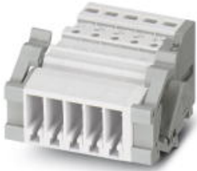
Panel feed-through, Width: 5.2 mm, Color: gray

Please be informed that the data shown in this PDF Document is generated from our Online Catalog. Please find the complete data in the user's documentation. Our General Terms of Use for Downloads are valid ( http://phoenixcontact.com/download )