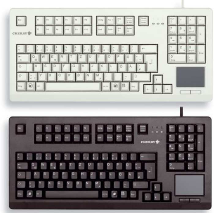
Models may vary from the image shown