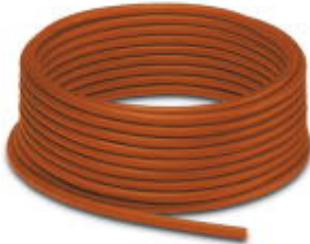
Sensor/Actuator cable, 3-position, PUR halogen-free, Irradiated, orange RAL 2003, free cable end, on free cable end, Cable length: 100 m

Please be informed that the data shown in this PDF Document is generated from our Online Catalog. Please find the complete data in the user's documentation. Our General Terms of Use for Downloads are valid ( http://phoenixcontact.com/download )