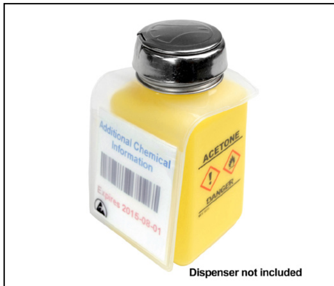
Figure 2. Item 35393 installed on a 6 oz bottle