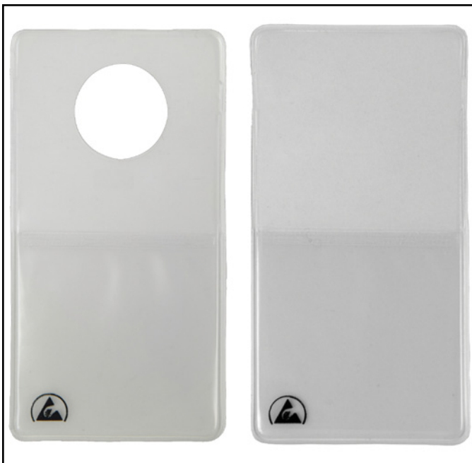
Figure 1. ESD Bottle Hang Tag, 35393 (left) & 35394 (right)