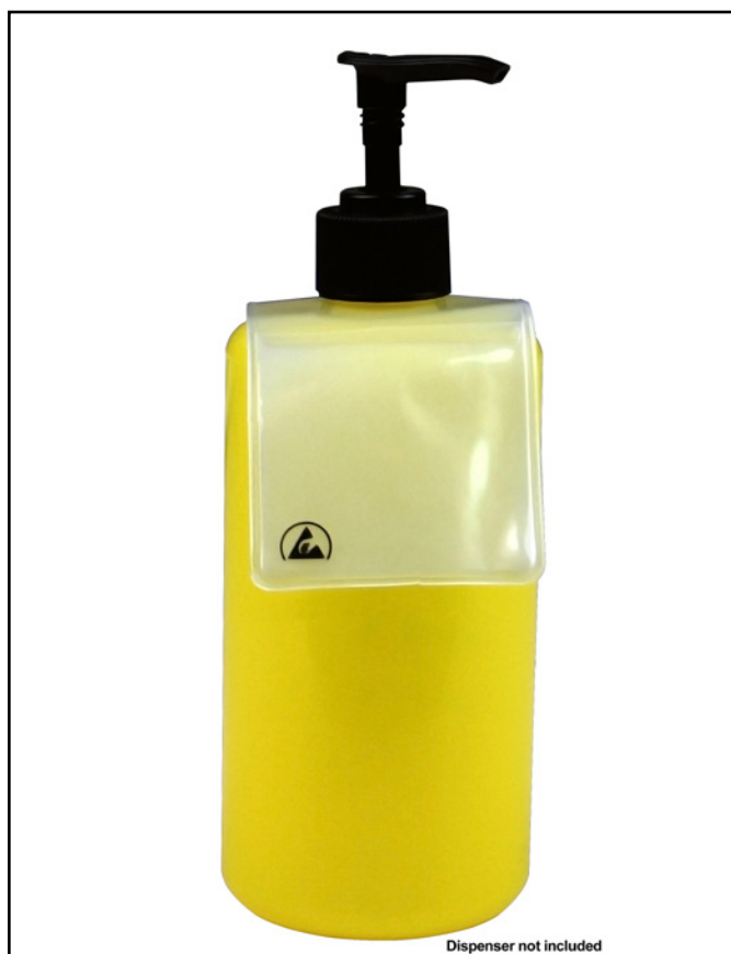
Figure 2. Item 35394 installed on an 8 oz wash bottle