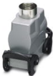
HEAVYCON B24 sleeve housing, with double locking latch, height: 72 mm, with 1 x M25 gland, straight cable outlet

Please be informed that the data shown in this PDF Document is generated from our Online Catalog. Please find the complete data in the user's documentation. Our General Terms of Use for Downloads are valid ( http://phoenixcontact.com/download )