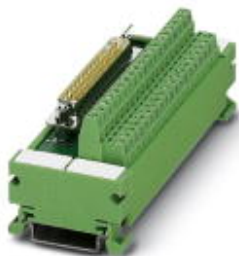
VARIOFACE module, with screw connection and D-subminiature pin strip, for assembly on NS 35/7.5, 37 positions

Please be informed that the data shown in this PDF Document is generated from our Online Catalog. Please find the complete data in the user's documentation. Our General Terms of Use for Downloads are valid ( http://phoenixcontact.com/download )