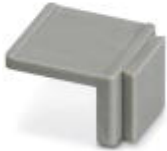
Equipment marker, narrow

Marking material - EMG-SGKS 10 - 2947585