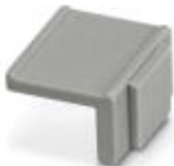
Equipment marker, width 12 mm