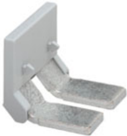
Insertion bridge, Number of positions: 2, Color: gray

Please be informed that the data shown in this PDF Document is generated from our Online Catalog. Please find the complete data in the user's documentation. Our General Terms of Use for Downloads are valid ( http://phoenixcontact.com/download )